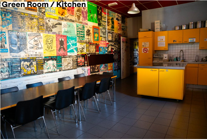
Green Room / Kitchen